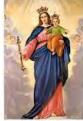
Mary, Help of Christians group for us

That everyone might have food: Let us pray that everyone, from large producers to small consumers, be committed to avoid wasting food, and to ensure that everyone has access to quality food.