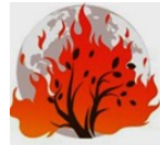
The Burning Bush

Listen to the Voice of Creation, to the Cry of the Earth and the Cry of the Poor.